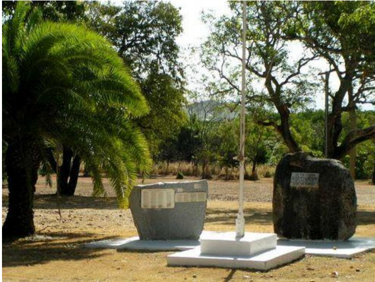
Cooktown War Memorial